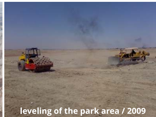
leveling of the park area / 2009