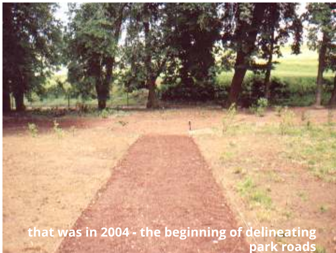
that was in 2004 - the beginning of delineating park roads