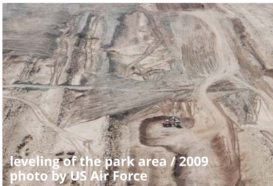
leveling of the park area / 2009 photo by US Air Force