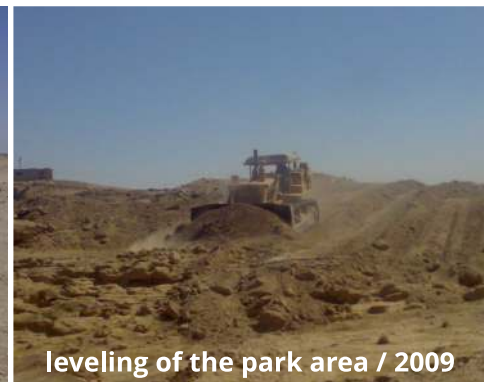
leveling of the park area / 2009