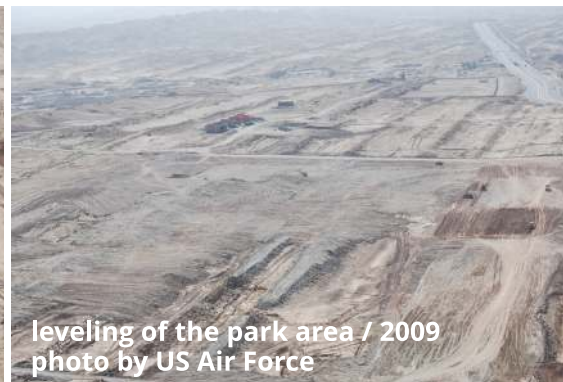
leveling of the park area / 2009