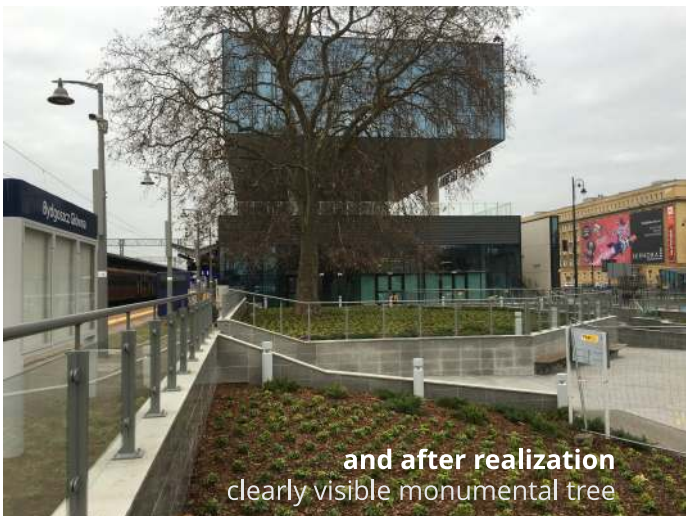
and after realization clearly visible monumental tree