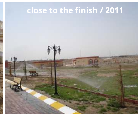
close to the finish / 2011