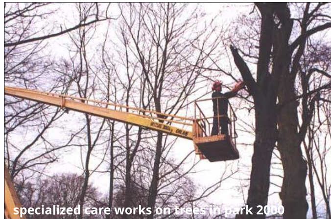
specialized care works on trees in park 2000