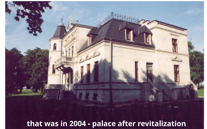
that was in 2004 - palace after revitalization