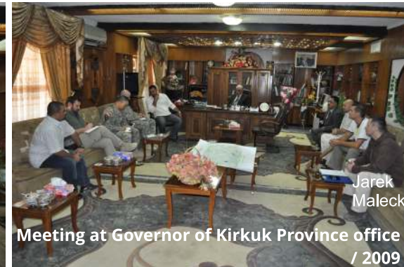
Meeting at Governor of Kirkuk Province office / 2009