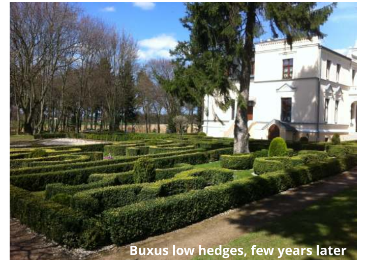
Buxus low hedges, few years later