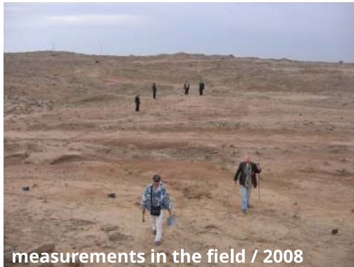
measurements in the field / 2008