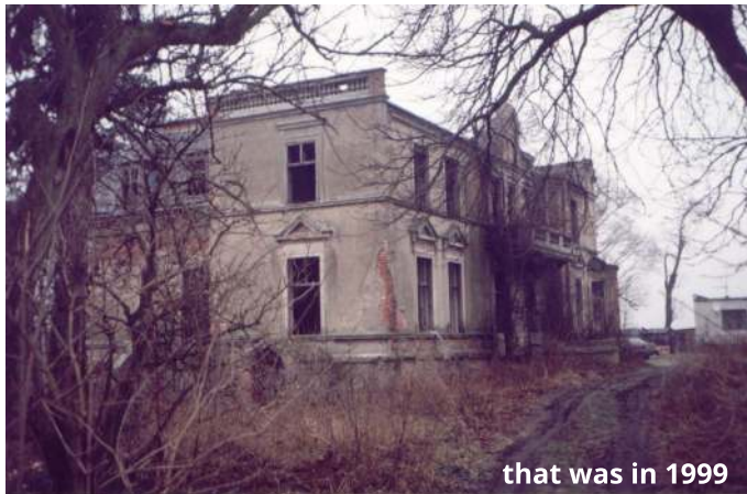
that was in 1999