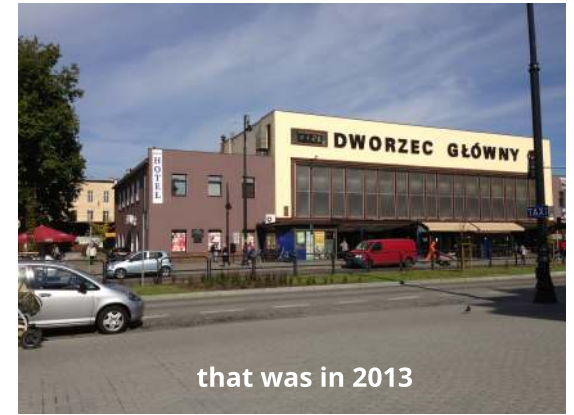
that was in 2013