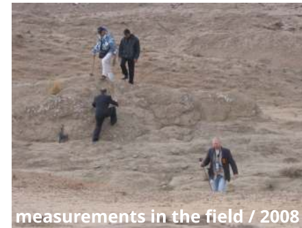
measurements in the field / 2008