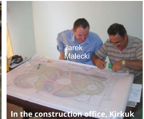
In the construction office, Kirkuk