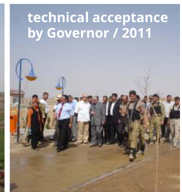
technical acceptance by Governor / 2011