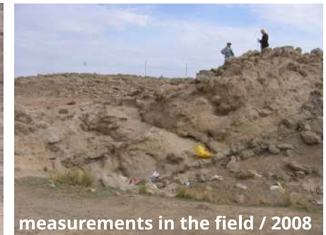
measurements in the field / 2008