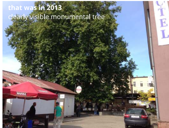
that was in 2013 clearly visible monumental tree