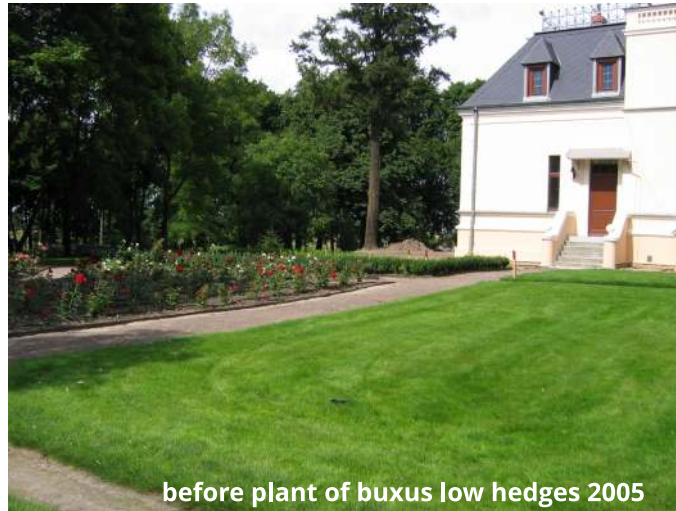
before plant of buxus low hedges 2005