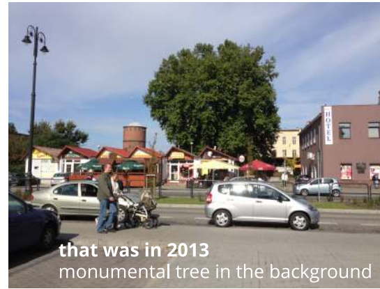
that was in 2013 monumental tree in the background