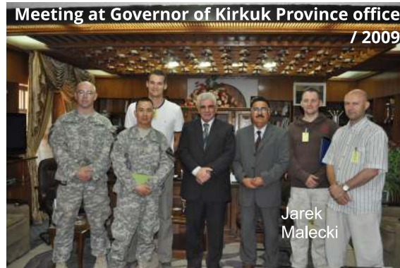
Meeting at Governor of Kirkuk Province office / 2009