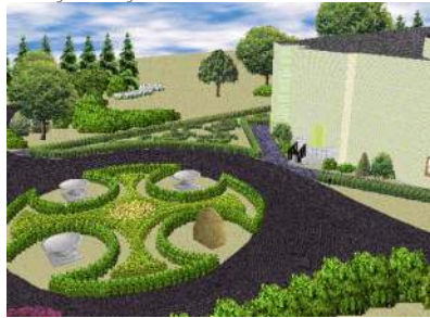
very early visualization