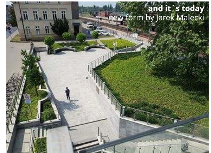
and it's today new form by Jarek Malecki