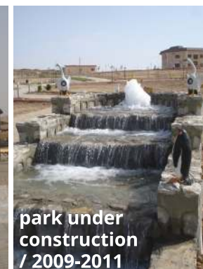
park under construction / 2009-2011