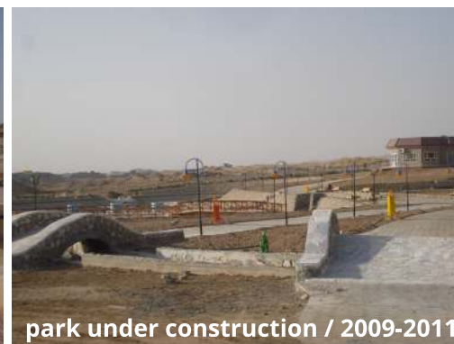
park under construction / 2009-2011