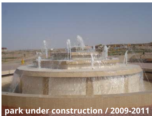
park under construction / 2009-2011